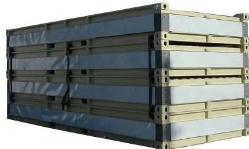
Collapsible Kit - can be stacked 4-high for transport & storage