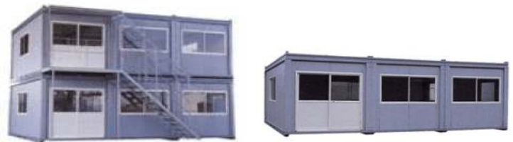
Create larger structures with connected units